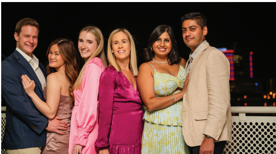
FALL FETE AT INDEPENDENCE SEAPORT MUSEUM