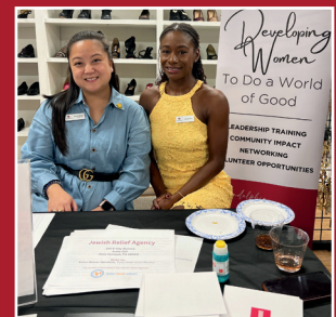
Find the Good Day