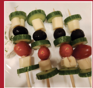
Kids in the Kitchen