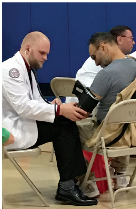
Blood Pressure check

Subsequent wellness events were held at CCV on Mondays in October, with each focusing on a different, specific health initiative.