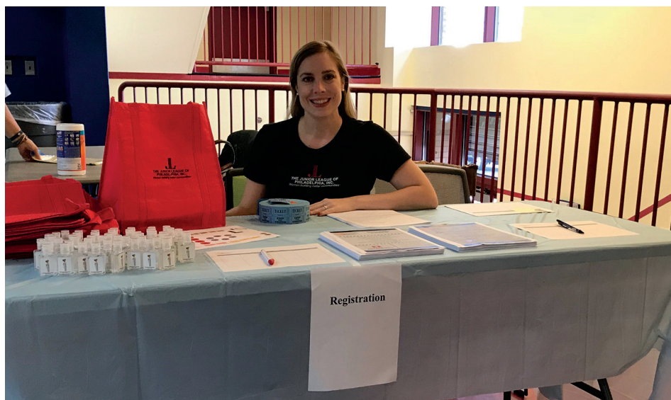
JLP member at registration