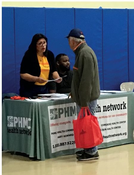
Attendee receiving health information

The Empowering You Health Fair Committee is pleased to have assisted in organizing the “Worthy and Wise” Wellness Expo at the Community Center at Visitation (CCV) for the second year in a row. On Monday, October 1, over 100 participants from the local community arrived for a morning full of