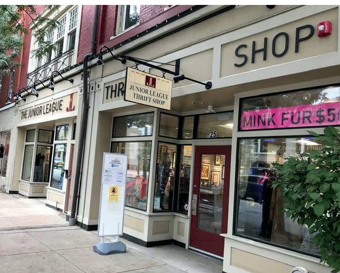
New thrift shop signage

JLP member quota donations will continue to be received in the basement of headquarters. As a friendly reminder, we will no longer accept upholstered items for donation, including stuffed animals, pillows, and plush linens. If you have an upcoming Thrift Shop shift, please be aware there are exciting opportunities for volunteers to host VIP flash sales with live Facebook feeds from the shop. Look for upcoming member opportunities to help decorate our new shop for the holidays.