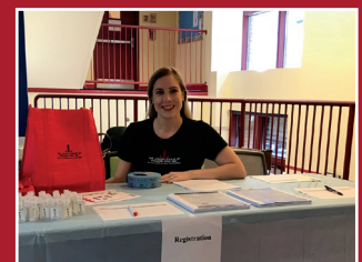
JLP and CCV at Annual Wellness Expo