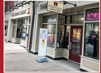
Thrift Shop Remodel Complete