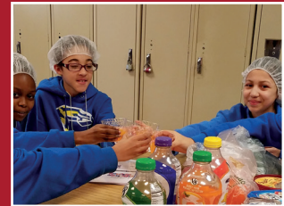
Kids in the Kitchen Prepares for 2018-2019